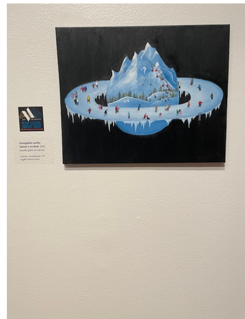
Evangeline Landry - Saturn's Ice Rink