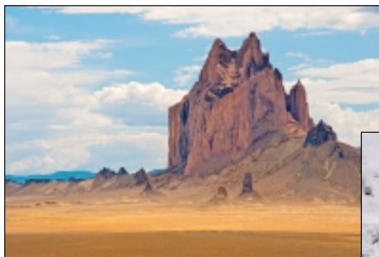
Shiprock, New Mexico