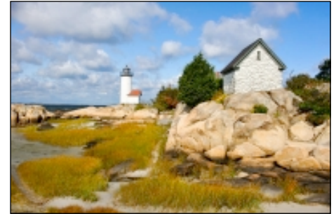
Annisquam Lighthouse - Massachusetts

More of his work, including beautiful scenes from throughout the country can be seen on his website www.lighteffectphoto.com .