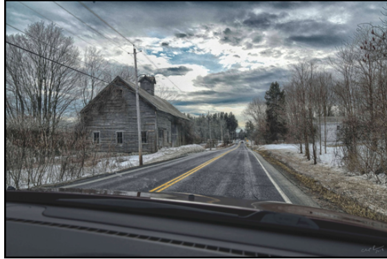
At left and above: Photography by Chip Perone