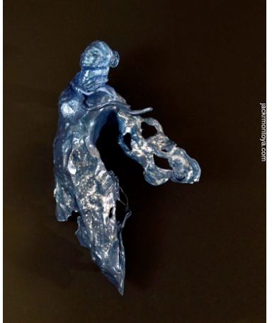
Waterfall, by Jack Montoya

Much influenced by the art of Anselm Kiefer and CY Twombly among many others, Valeria Orozco creates a romantic art she calls a "poetic conversation with painting and drawing." Using palette knives and thick paint, she manipulates her canvasses with layers as she paints, often producing romanticized landscapes and objects. Impressionism, expressionism and figuration all come to mind as descriptive terms applied to her work.