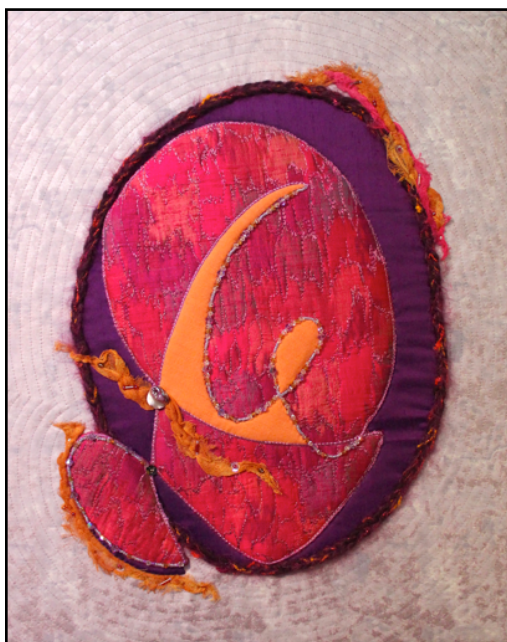
Quilt images this page by Kris Moss

Her philosophy is traditional. Kris eschews the use of paints or photographs, for example, much preferring to use the items mentioned above to create movement over dimensional forms to create beauty and